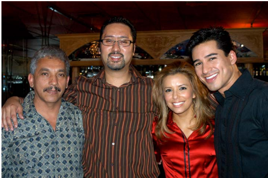
Mario Lopez and Eva Longoria at El Floridita, 2006

After church, I might go to In-N-Out for some burgers and then to a movie, or go to this hole-in-the-wall karaoke place in Koreatown. I think it's called something weird like the Western Music Factory. It's a dive -- you'd swear you're walking into a brothel. But it's got private rooms and it's fun to go there with friends, because you just sing in front of them, not a bunch of strangers. I'll do everything from Frank Sinatra to Bob Marley.